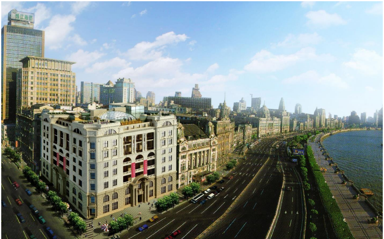
Render View: Christie's Shanghai Home will relocate to BUND ONE, joining the splendor of the Bund.

CENTURY-OLD LANDMARK ECHOES CHRISTIE'S HERITAGE